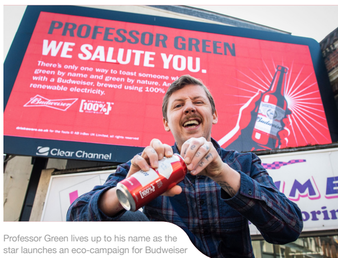
Professor Green lives up to his name as the star launches an eco-campaign for Budweiser