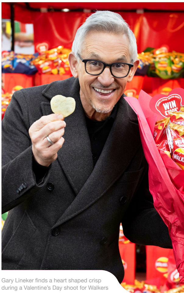
Gary Lineker finds a heart shaped crisp during a Valentine's Day shoot for Walkers